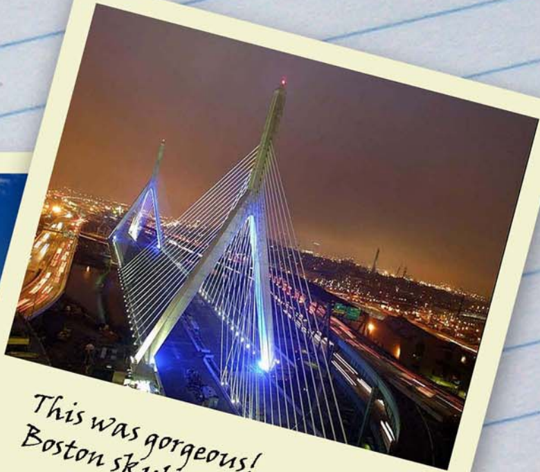
This was gorgeous! Boston skyline.

A resource for Olin families and guests when visiting the area, including shopping, dining, attractions, historical sites and much more!