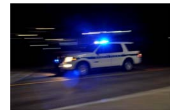
Public Safety Emergency Vehicle

Keys, Identification (Driver's License, Olin ID etc.) wallet/purse; money/credit cards