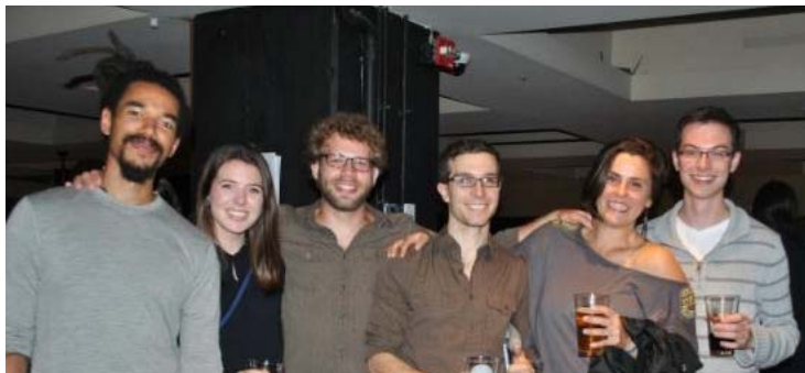
Cheers to Alumni Weekend (Meadhall in Cambridge, MA)

Alumni Weekend was a great success with surpassing our goals to increase attendance overall as well as for all alumni (12% of all alumni) and the 5-year reunion class (66% of the '09 class attended). Saturday night's celebration in the city also increased by nearly 40 attendees from last year. Check out our Flickr images to see the fun, connection and continuous learning we achieved. Whether or not you attended the weekend, please help us plan for the future by answering a few simple questions about your Alumni Weekend experience HERE .